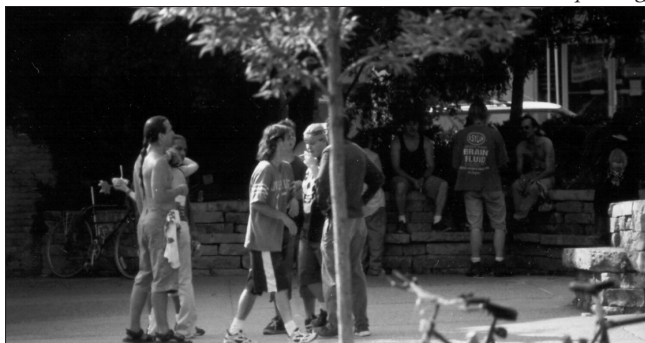
Congregating in public is an important aspect of youth socialization.