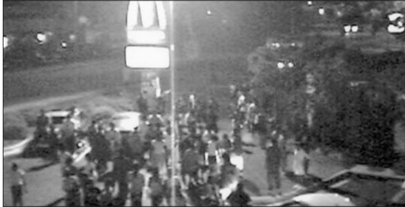
Fast-food restaurants are popular locations for youth to hang out.

Among the specific behaviors (some legal and some not) commonly associated with youth disorderly conduct are: