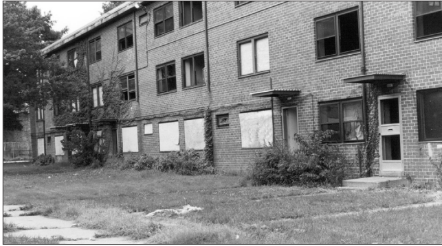
Urban areas with poorly-maintained, high-density low-income housing are often the site of open-air drug markets.

Key figures in the function of open-air drug markets are “place managers” such as landlords, housing authorities, local business residents and tenants associations. Those who diligently control their apartment buildings or the business premises forecourt will reduce the chance of an illicit market becoming established in their neighborhood, and drug sellers will often operate from locations where place managers do not attempt to exert any control over illicit activity. 15 Open-air drug markets are therefore more likely to become established in areas where there is a high rate of rental properties and/or public housing rather than in owner-occupied neighborhoods.