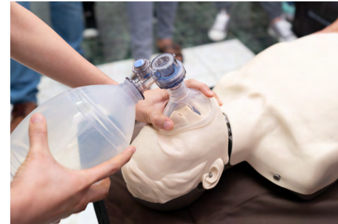
Beyond potency, another factor that people worry about with overdose is the potential for respiratory depression to return after the antidote—which works for 30 to 90 minutes—wears off.

Fentanyl’s potency and rapid binding to opioid receptors in the brain are at the core of questions about whether standard naloxone can outcompete the drug and successfully reverse overdoses. 33 Although research consistently shows that naloxone is effective at reversing fentanyl overdoses, some data from animal and laboratory studies have challenged standard dosing protocols. For example, in mice, higher doses of opioid agonists were found to require correspondingly higher doses of naloxone. 34 In addition, human studies in hospital settings revealed mixed outcomes when it comes to the relative efficacy of standard versus high-dose naloxone in preventing