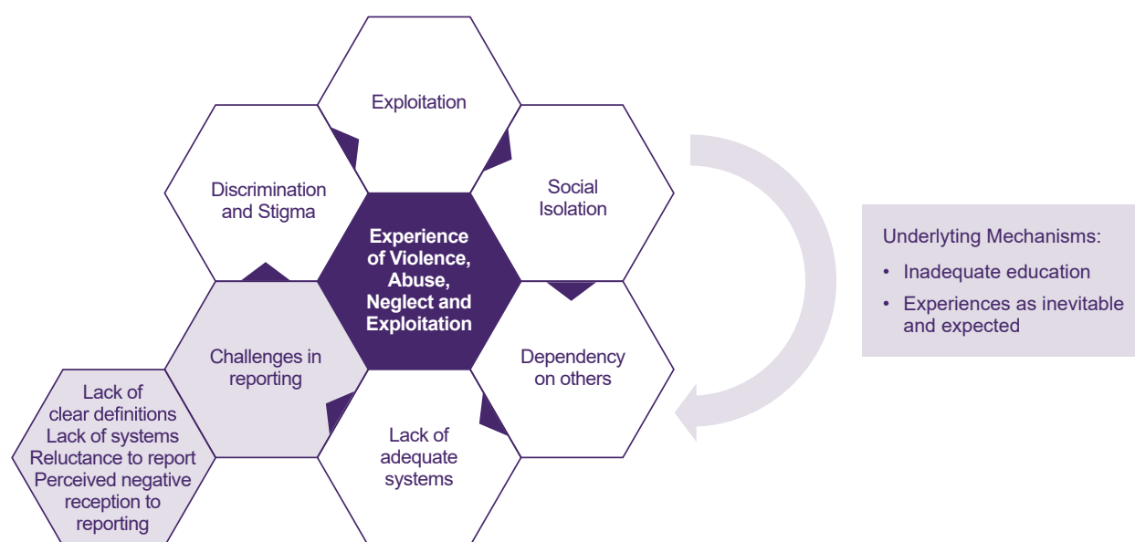
Figure 2: Interaction between the 3 themes

Underlying the first two themes is the final theme of Underlying Mechanisms behind experiences of violence, abuse, neglect and exploitation by people with disabilities (Figure 2). Although there are multiple mechanisms, some of which have been explored above, there are two main subthemes that were identified in the literature. First, the acceptance of violence, abuse, neglect and exploitation as part of daily life by people with disabilities, and second, a consistent lack of education and awareness on the part of both people with disabilities and the people who support them (formally or informally).