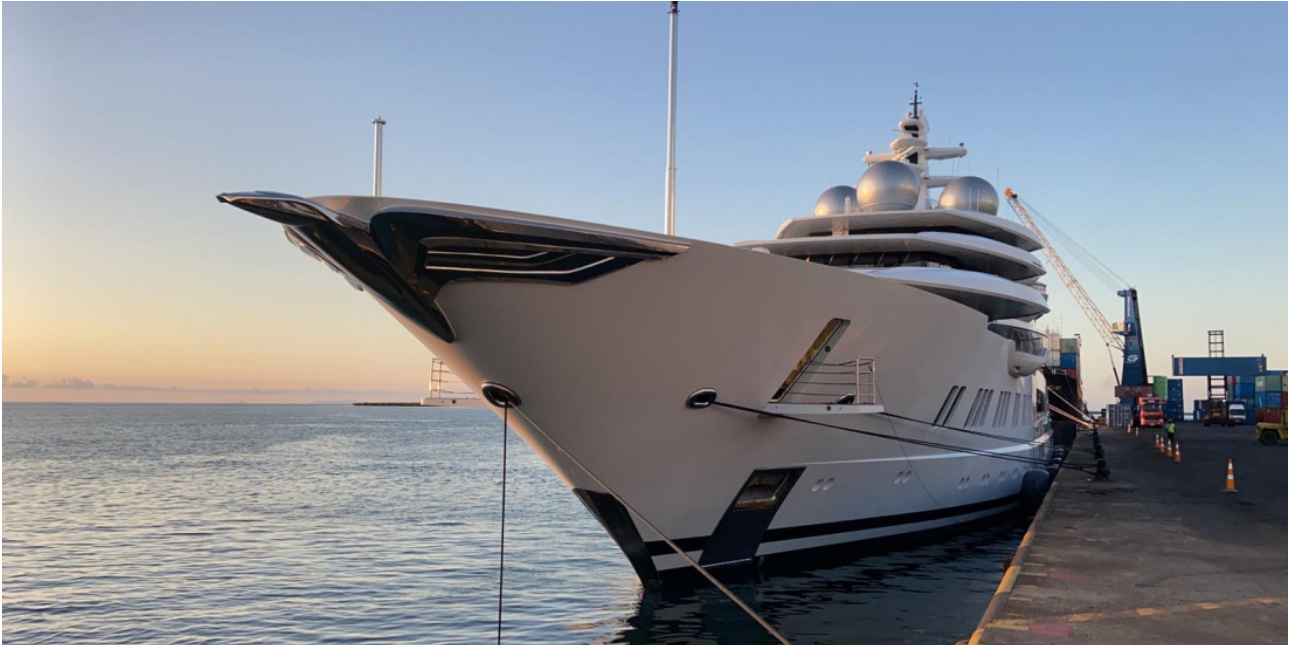
The seizure of a yacht belonging to Russian billionaire Suleiman Kerimov in 2022 exposed a web of Pacific island-registered shell companies and trusts built to hide Kerimov's identity.

Lastly, the GI-TOC's conversations with financial crime investigators highlighted a further source of concern. In December 2022, RMI passed the Decentralized Autonomous Organizations (DAO) Act, allowing both profit and non-profit legal entities to adopt DAO structures and register in the country as limited liability companies. 108 A DAO is 'a blockchain-based system that enables people to coordinate and govern themselves mediated by a set of self-executing rules deployed on a public blockchain, and whose governance is decentralized (i.e., independent from central control)'. 109 Although these are early days, there are concerns that these company structures could be used for money laundering purposes and as cover for criminal transactions in the future. 110