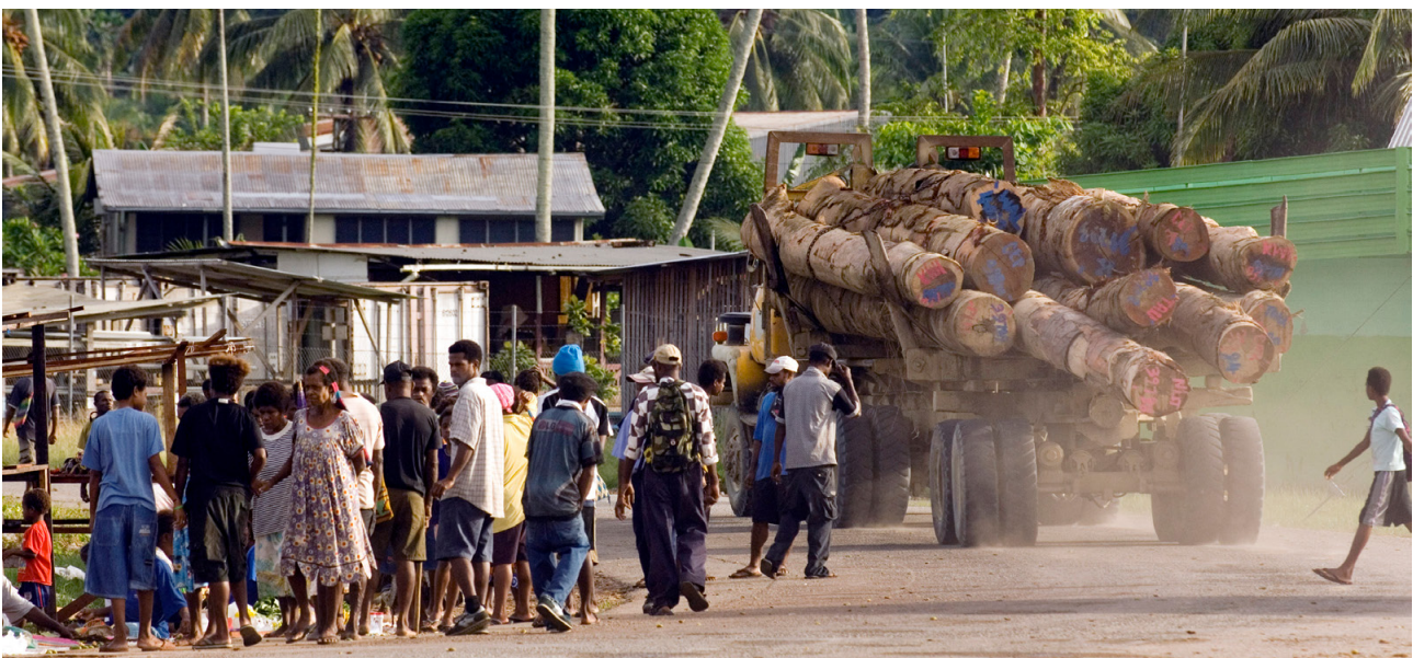
A logging truck heads through the village of Vanimo, Papua New Guinea, en route to a log camp for eventual export to China by sea.

As with the fishing industry, it is foreign companies that dominate the timber scene in the Pacific, especially those from Malaysia and China. Many of these are known to engage in opaque operations in PNG and have developed close ties to political figures. Usually, they obtain regular logging concessions but fail to abide by their restrictions, underreport timber exports, evade taxes and launder the proceeds of their sales. 31