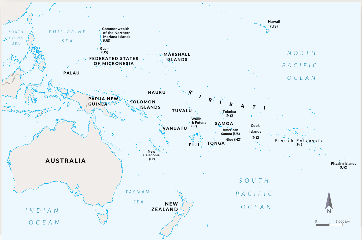
FIGURE 3 Pacific island countries and territories.

and exported commodities make up the bulk of exports, with obvious repercussions for the tax revenues of Pacific countries. 3 Meanwhile, these activities and related illicit proceeds also have a corrupting effects on authorities, sometimes at the highest level.