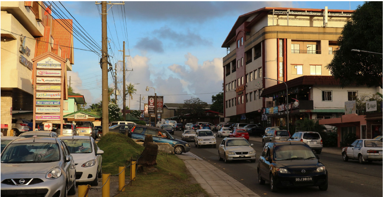
The commercial centre of Koror in the Pacific island nation of Palau, where over 160 trafficked Chinese nationals were discovered in 2019.