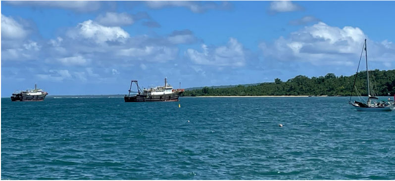
Seized illegal fishing boats in the capital of Vanuatu, Port Vila. Illegal, unreported and unregulated fishing is a major challenge for Pacific island nations.

Once dominated by American and Japanese fleets, the early 21st century has seen Chinese vessels become the principal actors in industrial-scale fishing in the Pacific, both within EEZs and on the high seas (international waters), making China's the largest distant fishing fleet in the world. 12 Indeed, state-owned and private Chinese fishing companies are the most cited for IUU fishing offences (although they are not the only ones, with South Korean, Taiwanese, 13 Japanese 14 and Vanuatu-flagged vessels also regularly implicated). Incident data compiled by the Environmental Justice Foundation has shown that between 2015 and 2019, most of the illegal fishing incidents involving Chinese-flagged or -owned longliners occurred in waters beyond the country's national jurisdiction, including areas governed by the Western and Central Pacific Fisheries Commission (WCPFC), Vanuatu, Cook Islands and French Polynesia. The most common offences included shark finning, non-compliance with reporting requirements, the fishing of protected species and non-authorized fishing. 15