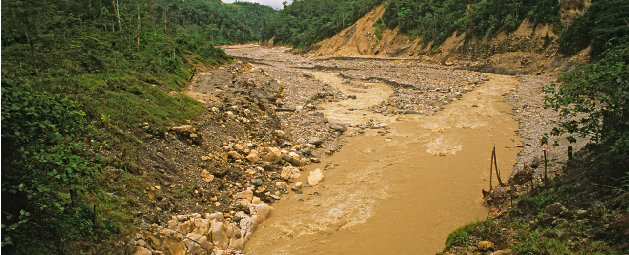
The Ok Tedi river in Papua New Guinea has been reduced to a mine tailings drain. The river carries the muddy waste from Ok Tedi gold and copper mine towards the Fly River, where it affects both aquatic life and the people who live along it.