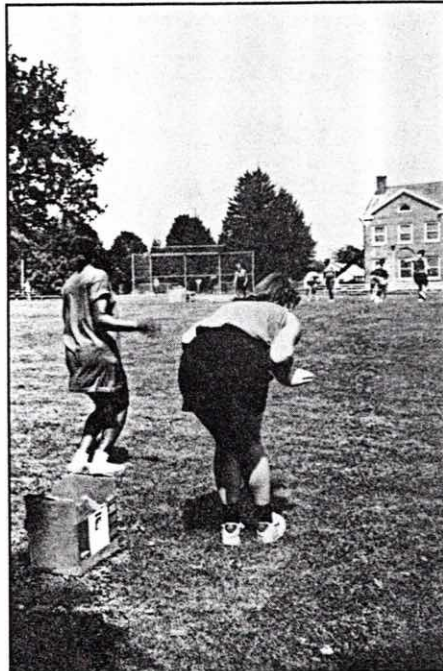
Living units often field teams for such sports as softball and soccer (here, at the Federal Prison Camp, Alderson, West Virginia).

Other units provide education, training, or work experiences , and "an appropriately designed counseling program." 15 The inmates in such units have obvious deficits (marginal literacy, lack of